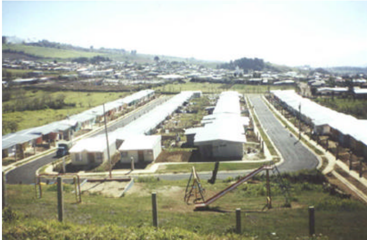
Aquitava housing project outside Carthago